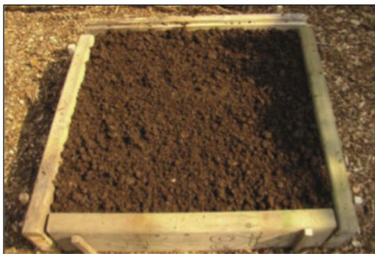
Raised bed filled with home-made compost

There are all sorts of compost bins, ranging from the well-known black plastic 'dalek' bin to those made out of wooden pallets, which give you lots of room. You can even just make a pile and cover it with eg. carpet or ground cover, to keep in the warmth which, together with the bacteria, helps create the compost, though this may take a bit longer to rot down than in a bin.